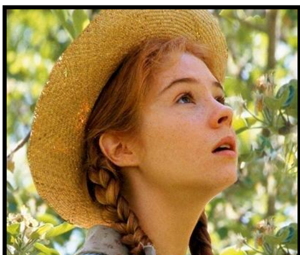
Megan Follows as Anne Shirley

Matthew Cuthbert and his sister, Marilla, live in Avonlea on Canada's Prince Edward Island. Needing help on their farm, Green Gables, they apply to adopt a boy from an orphanage. By mistake, however, a red-haired,